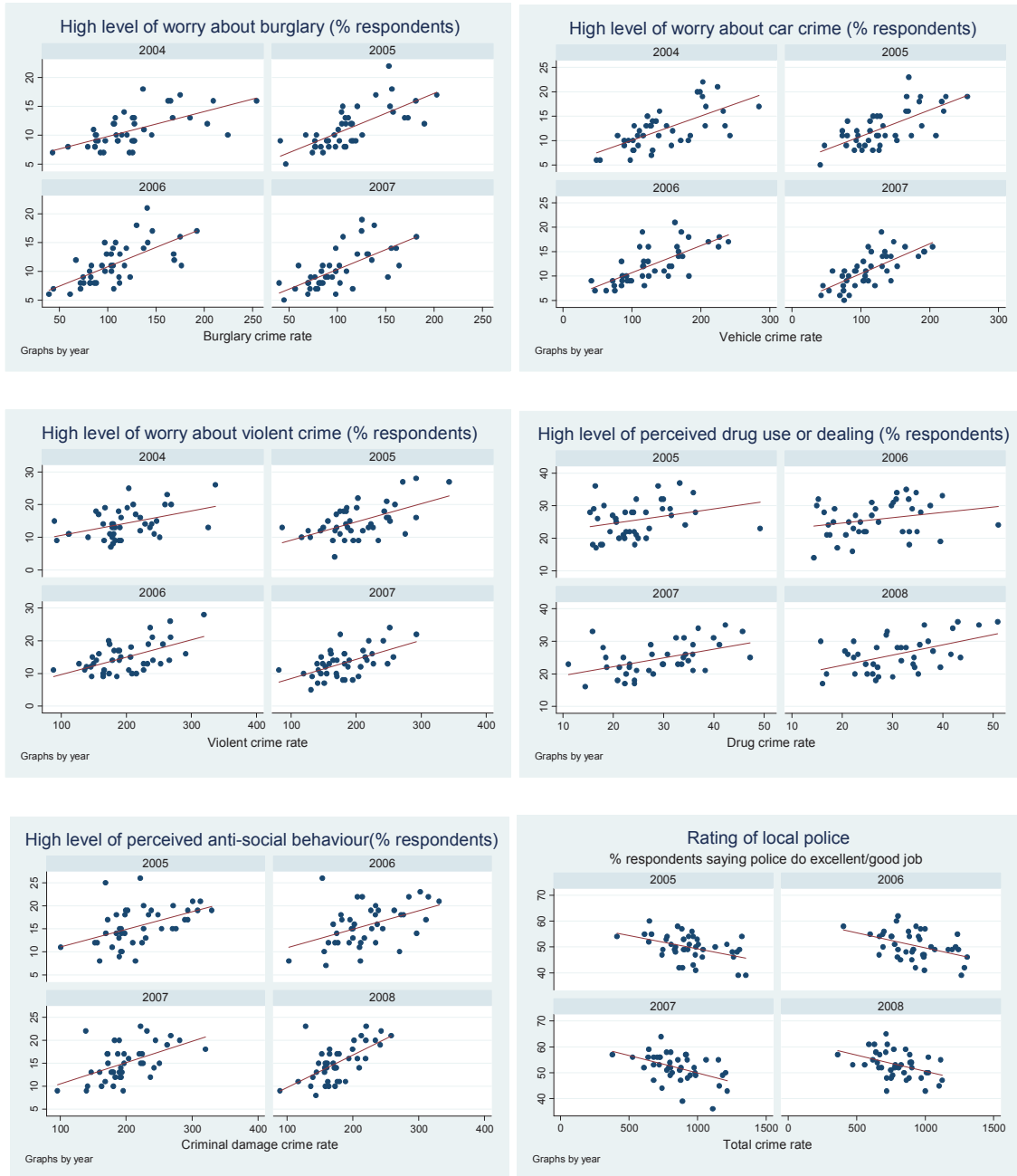
Figure A 1 – Concern about crime and risky behaviour, rating of local police and local crime, by PFA; BCS data (2004-2008)

Note. Authors' calculations from British Crime Survey (BCS) data and UK Home Office recorded crime statistics.