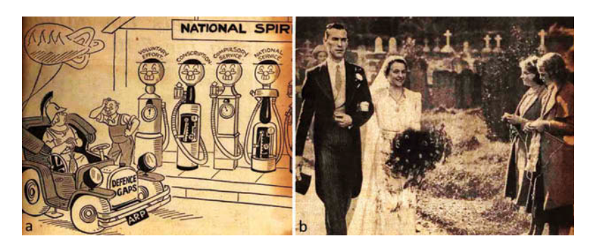
Figure 4. Pictures for assessing visual object recognition. See text. [To view this figure in color, please see the online version of this Journal.]

This patient exhibited many of the clinical features we would now regard as classical for the SD syndrome. She presented with progressive fluent aphasia manifesting as early severe anomia and loss of comprehension of words. She also demonstrated loss of vocabulary-based reading and spelling characterized by a surface dyslexia and dysgraphia but with intact grammar, phonology, and repetition. Indeed, these language features would have fulfilled current consensus diagnostic criteria for the "semantic variant" of PPA (Gorno-Tempini et al., 2011); in addition to this leading deficit of verbal semantic memory, there