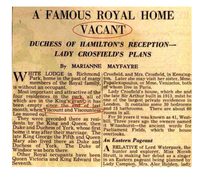
Figure 3. Newspaper passage for reading aloud. Words on which the patient made regularization errors are circled in red. [To view this figure in color, please see the online version of this Journal.]

personality, and to be distractible and garrulous. It was commented that "on hearing her prattle, nothing strikingly abnormal was at first noticed but mistakes were detected not expected in her stratum of society". Examples included "recovered me" for "cured me" and "I am very physical" for "I am very healthy". Although her speech was well articulated and grammatical, she was noted to make frequent use of circumlocutions and to have particular difficulty finding names. The patient was unable to name a pencil, torch, tape measure, or towel. There was further evidence of a "gross agnosia" for words. She brought with her extensive lists of words whose meanings she no longer knew, prepared with the assistance of a friend (Figure 2); examples include "kettle", "saucepan", "floor", "fountain", and "desert". She was able to repeat words normally. Reading aloud from a newspaper clipping (Figure 3) was