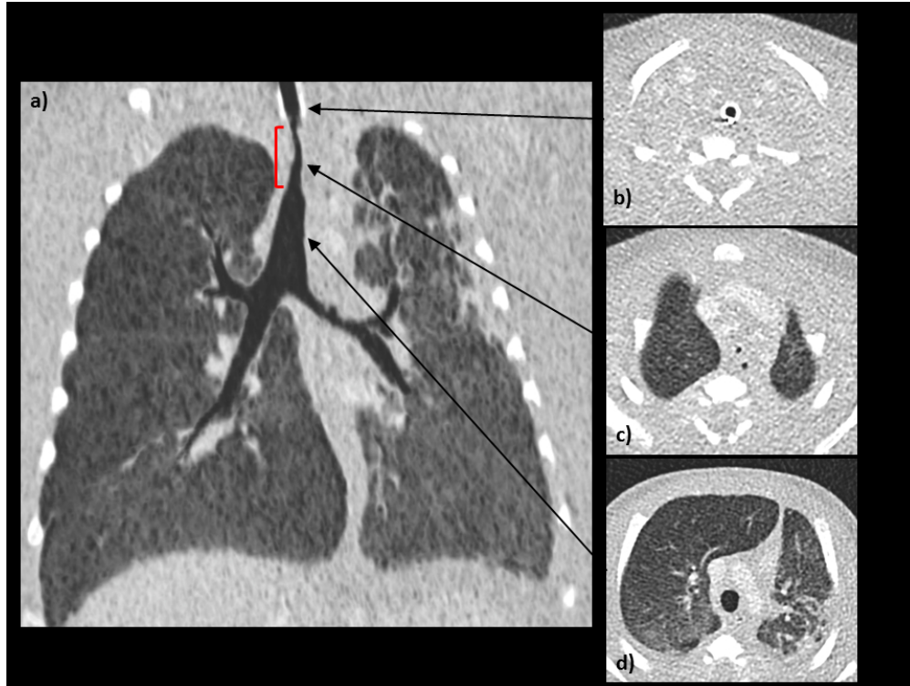
Antemortem CT Thorax obtained one month prior to death. (a) A coronal 5mm minimum intensity projection (miniP) image, viewed on lung windows, demonstrates the tight tracheal stenosis immediately distal to the endotracheal tube (red square bracket). Axial CT sections obtained (b) above, (c) at the level of the stenosis and (d) inferior to the stenosis show the relative narrowing of the trachea in relation to the intubated and non-stenosed sections (arrows).